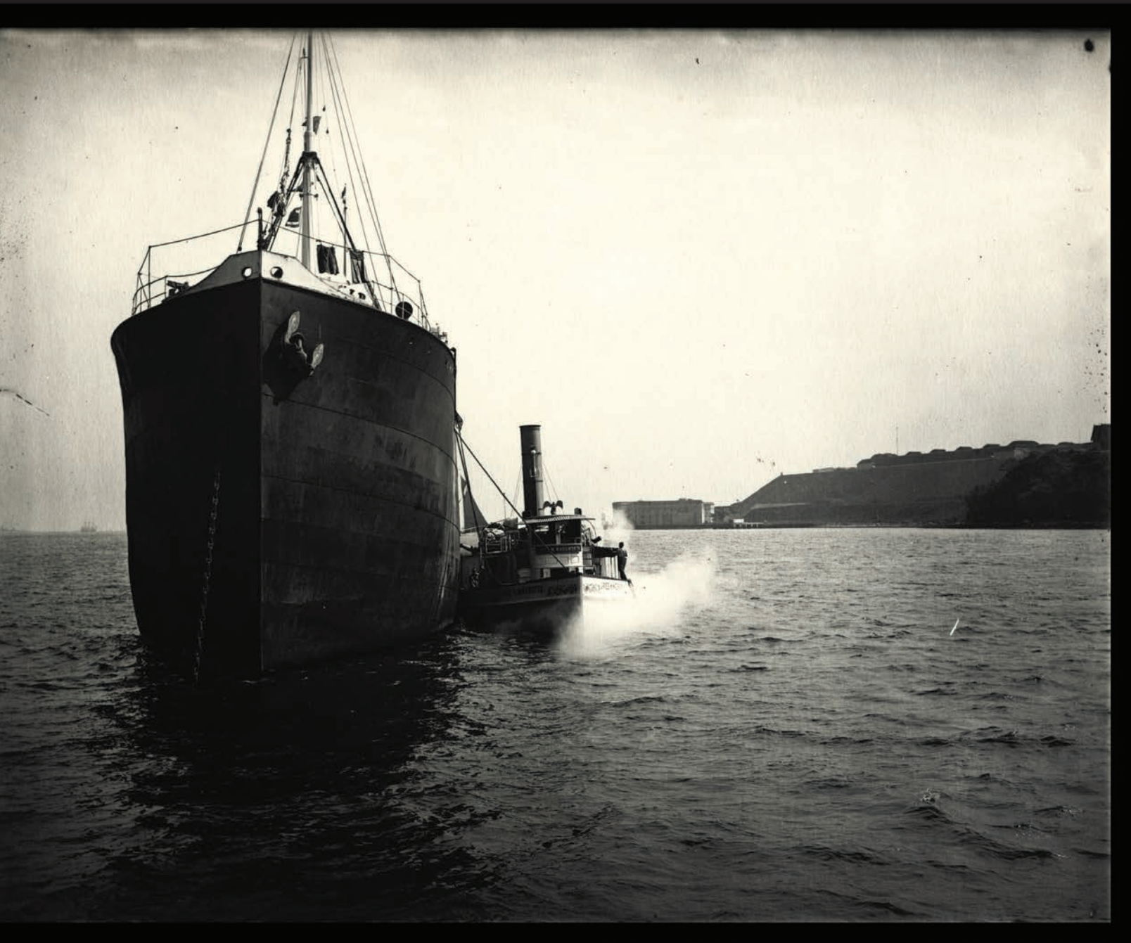
[Quarantine boat James W. Wadsworth alongside ship Cyrene ]