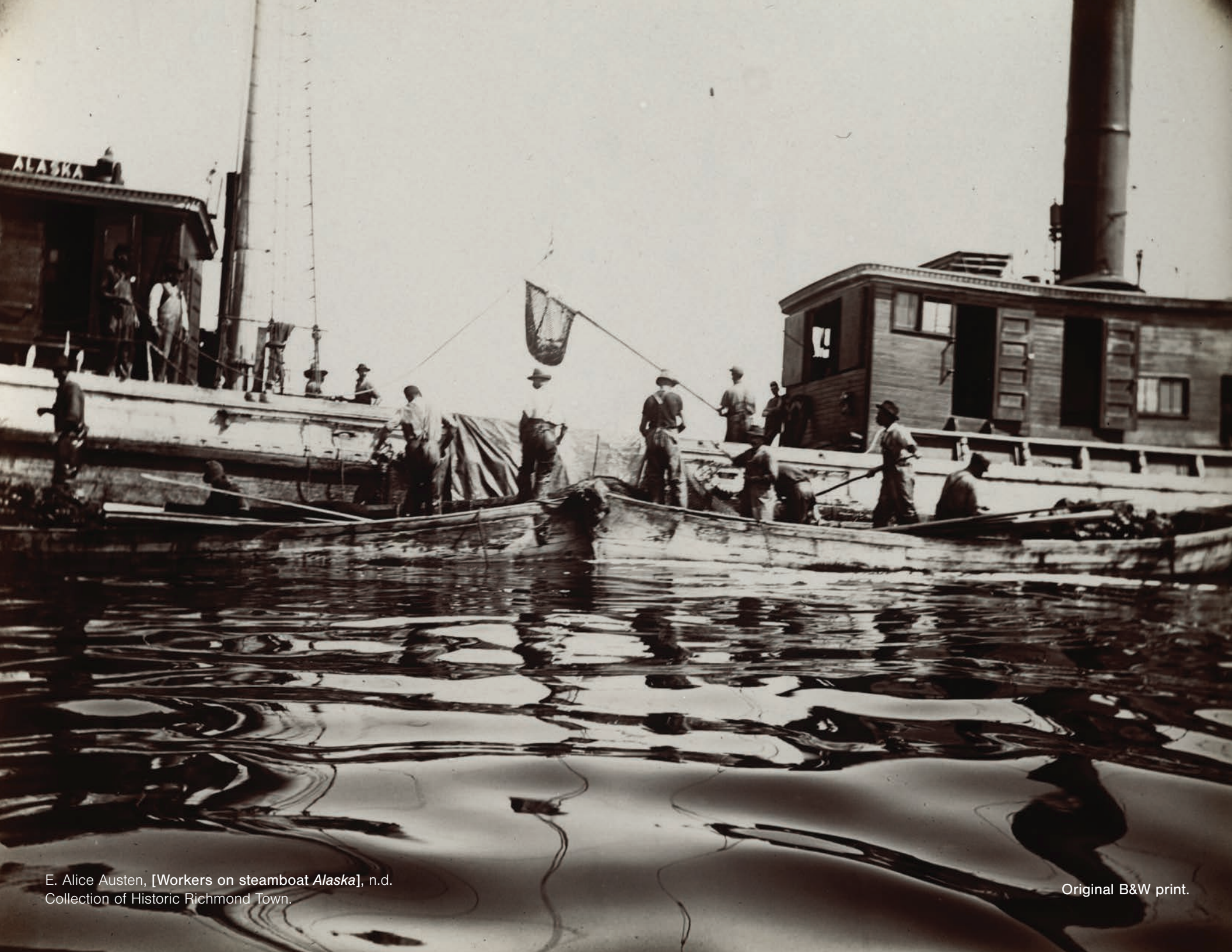
[Workers on steamboat Alaska ], n.d.