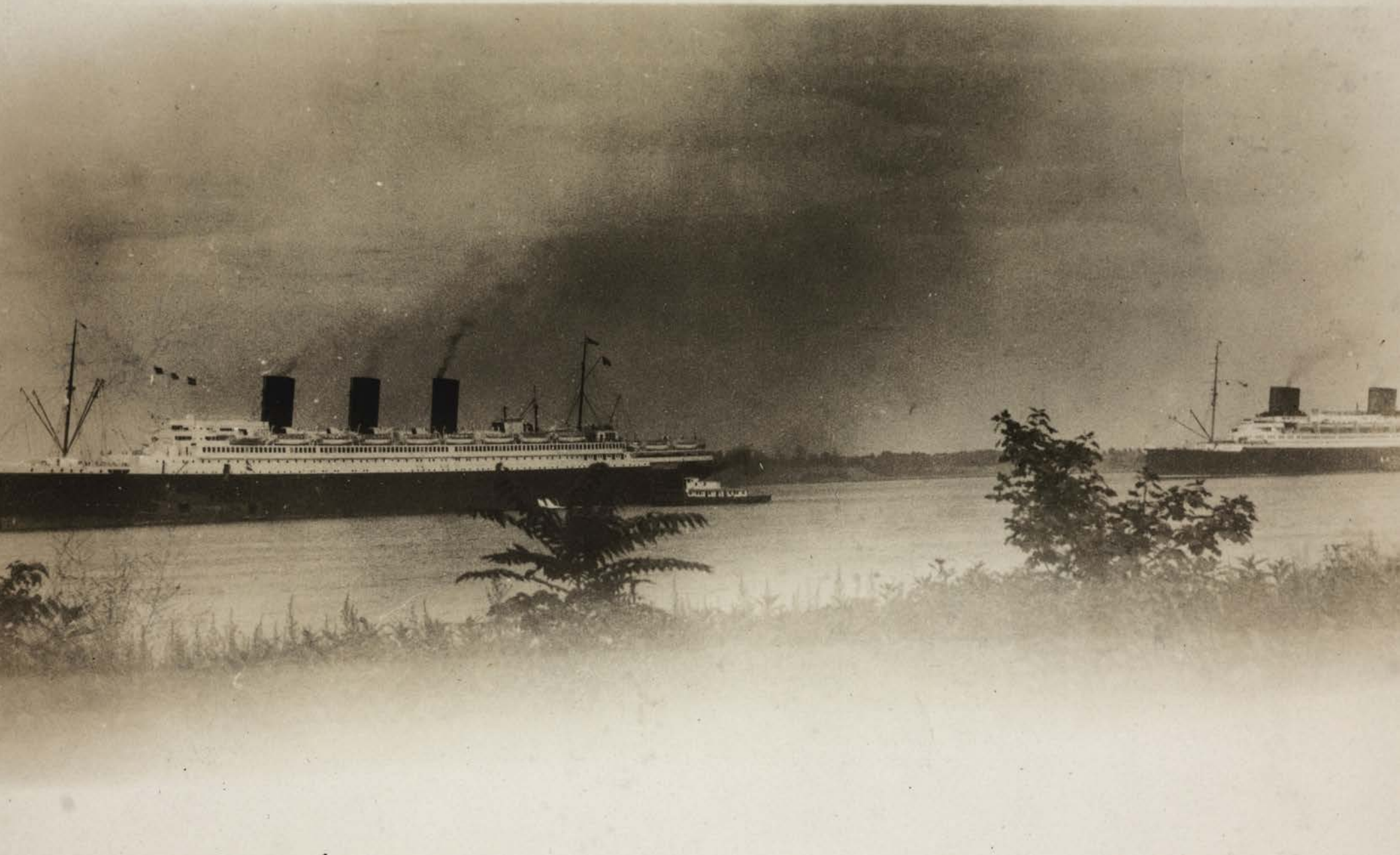
E. Alice Austen, [Steamships seen from Clear Comfort], n.d. Collection of Historic Richmond Town.