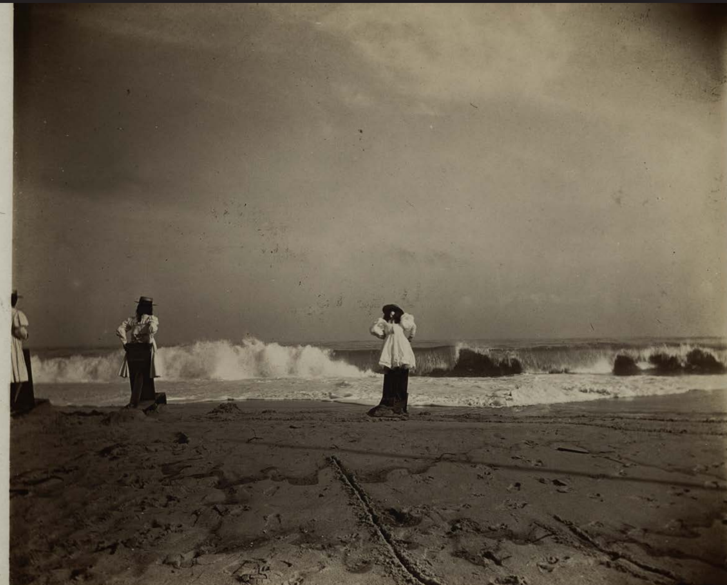
E. Alice Austen, [Three girls on the beach], n.d.