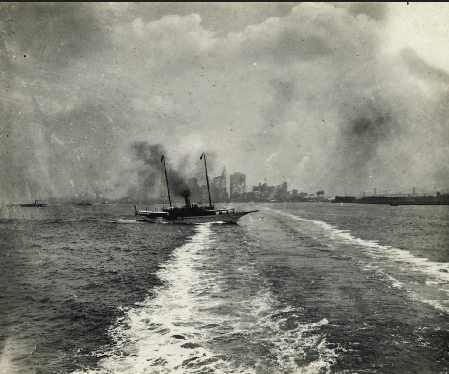
E. Alice Austen, [ Steam yacht in New York Harbor ], n.d.