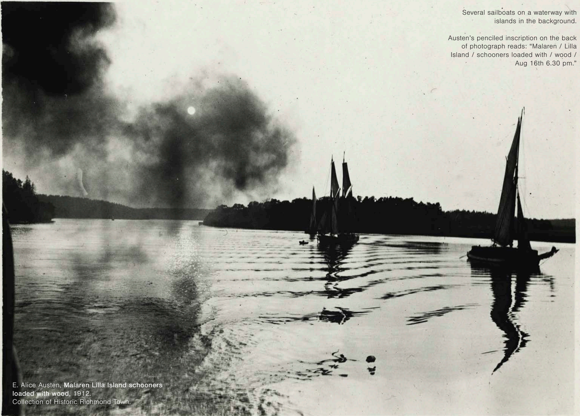
E. Alice Austen, Malaren Lilla Island schooners loaded with wood, 1912.

Austen's penciled inscription on the back of photograph reads: "Malaren / Lilla Island / schooners loaded with / wood / Aug 16th 6.30 pm."